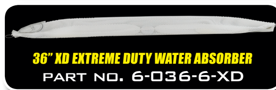
36" XD EXTREME DUTY WATER ABSORBER PART NO. 6-036-6-XD