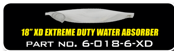
18" XD EXTREME DUTY WATER ABSORBER PART NO. 6-018-6-XD

Always dispose of in accordance with federal, state and local laws.